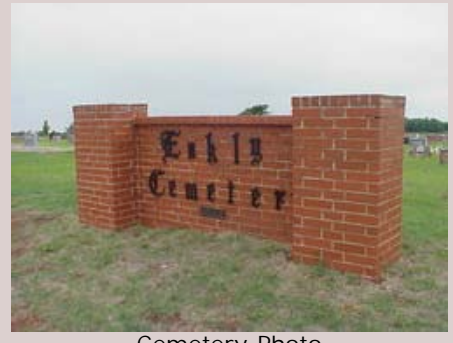
Cemetery Photo Added by: Rita Goodwin