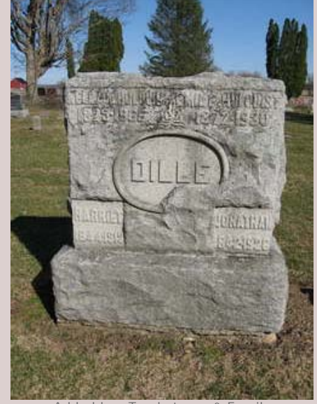
Added by: Tombstoner & Family

Created by: <u>Tombstoner & Family</u> Record added: Jun 26, 2009 Find A Grave Memorial# 38783958