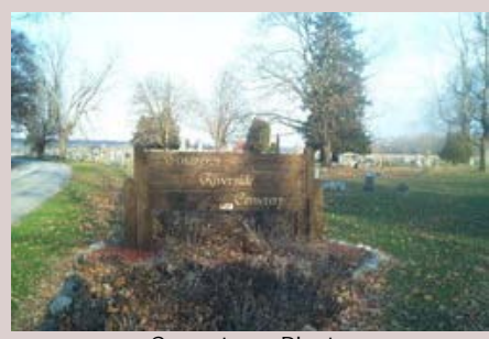
Cemetery Photo Added by: Tombstoner & Family